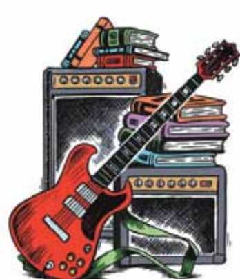
Bring a lawnchair & stay for the band!

LIVE Music by Riding Atlas, 5pm to 6:30 pm • Summer Reading Registration & PRIZES • FREE water & popcorn • Purchase Happy Joe's Pizza & Scratch Curbside Cupcakes