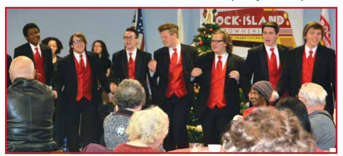
Rock Island High School Chamber Choir performing at the Holiday Luncheon.