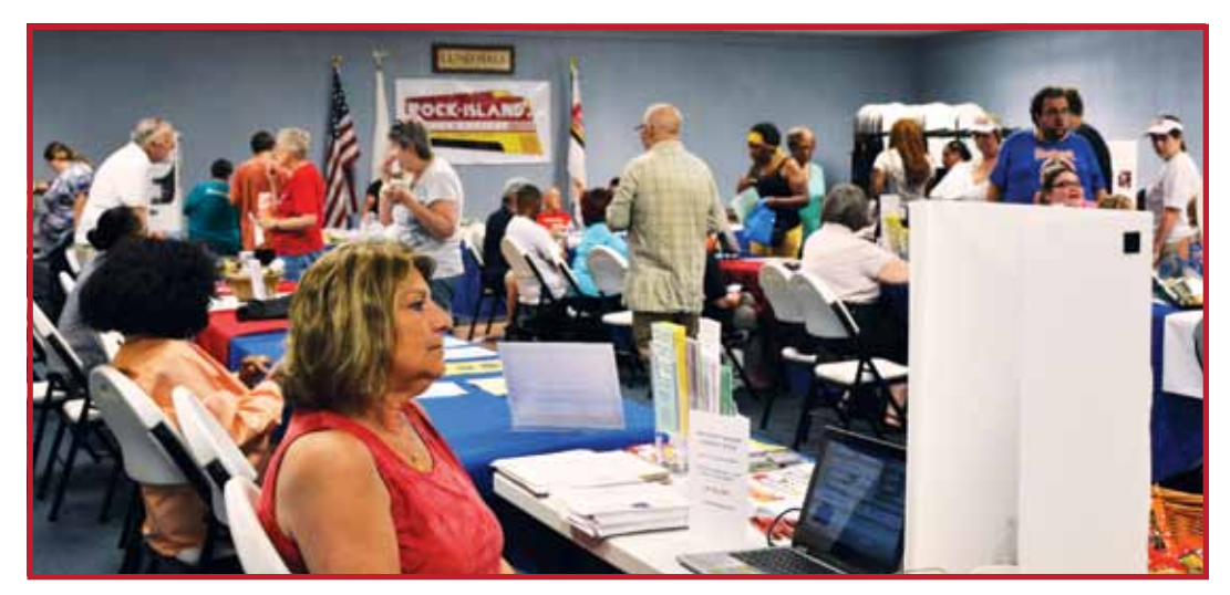
Above: Rock Island Township's Lund Hall was filled with residents and representatives of agencies providing services ranging from food pantries to home repairs.