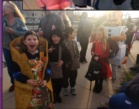
Lines were out of the park!