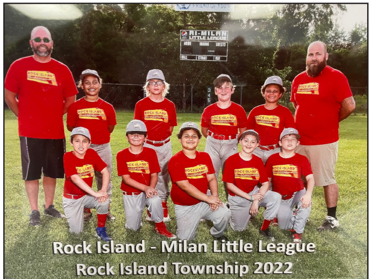
Rock Island - Milan Little League Rock Island Township 2022

We were happy to sponsor the Rock Island-Milan boys baseball league last year and look forward to sponsoring them again this year!