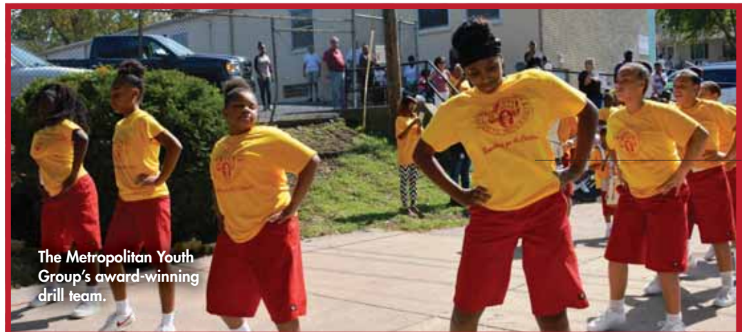
The Metropolitan Youth Group's award-winning drill team.

Township Day will be fun and informative and will open your eyes to the incredible range of services available to Rock Island Township residents.