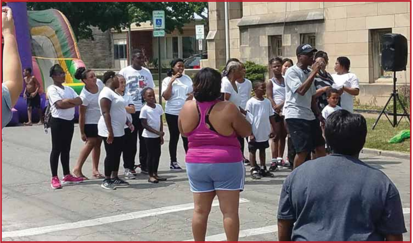
Greater Antioch Church's choral troupe and a local rapper entertained the crowd at the August 4th community event.