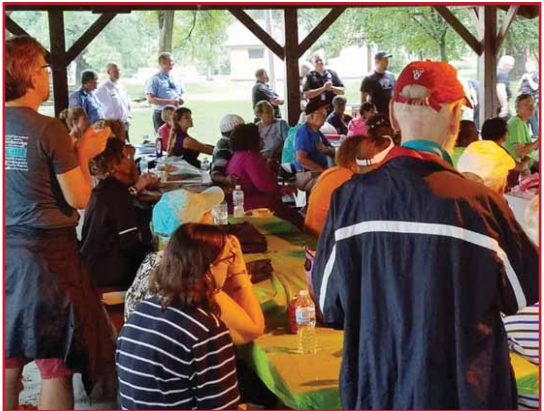
A small and brave crowd braved the torrential downpour to enjoy hot dogs, K-9 demonstration and information from the Housing Authority and Township at the 35th Annual National Night Out.